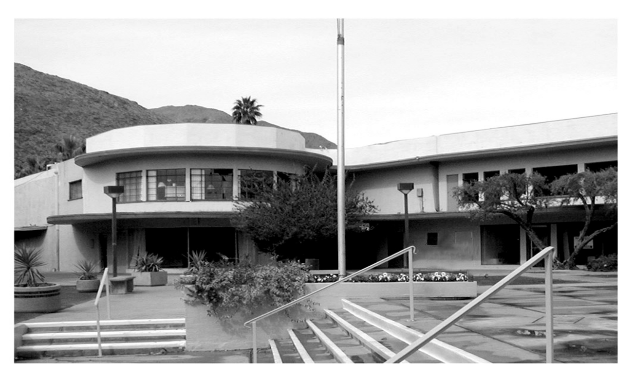
Figure 4 In this February 2000 photograph the T&CC appears to be occupied and well maintained; the landscape is manicured and paved areas are freshly washed. Under the present ownership it has been allowed to deteriorate.

False: Both Republicans and Democrats, liberals and conservatives, have supported historic preservation. Beginning with Abraham Lincoln's dedication of the Gettysburg battlefield to First Lady Laura Bush's commitment to the Preserve America program, Republicans can be proud of their commitment to the cause of historic preservation. Likewise Democrats can proudly point to the National Historic Preservation Act (NHPA), signed into law in 1966 by President Lyndon Johnson. The NHPA remains the most farreaching preservation legislation ever enacted. Historic preservation is one issue that should always be a non-partisan issue.