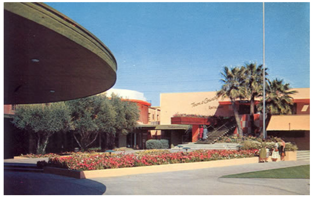
Figure 1 Historic postcard of the T&CC, circa 1948.