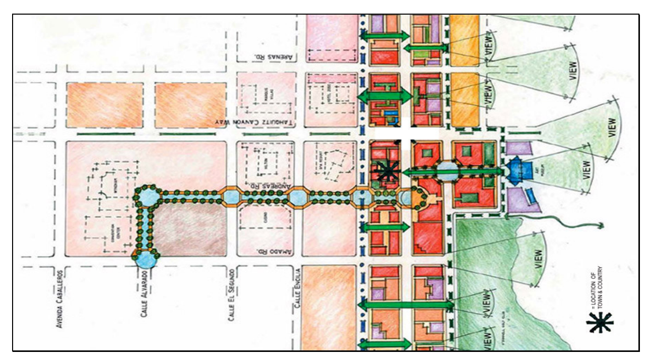
Figure 3 In this excerpt from the Downtown Plan, a Promenade from the Convention Center to the downtown is created along Andreas Road; there is no conflict between the Promenade and the Town & Country Center which is located about 200 feet south of Andreas.

False: This seems to be a local myth that defies explanation. As illustrated in this street layout from the city's 2005 Downtown Plan, access to downtown from the convention center is not impacted in any way by the T&CC. Easy direct access is already available via Andreas Road.