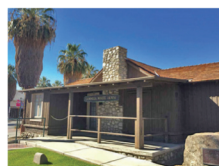
Cornelia White House, 1893