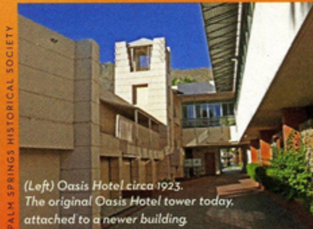
(Left) Oasis Hotel circa 1925. The original Oasis Hotel tower today, attached to a newer building.