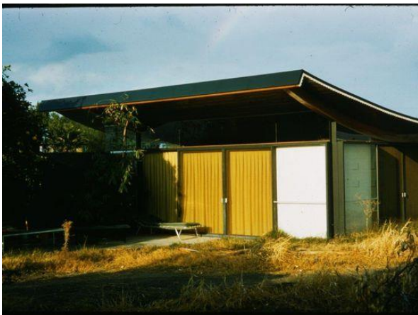
This vintage photo shows west side of the roof and patio area of the Miles Bates house in Palm Desert. The sliding glass doors opened into the kitchen area. The photo is from the Walter S. White papers, Architecture and Design Collection, at the Art, Design & Architecture Museum at UC Santa Barbara.