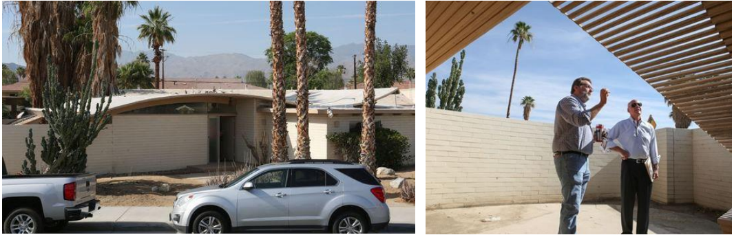
The city is considering preserving a historic wave house in Palm Desert.