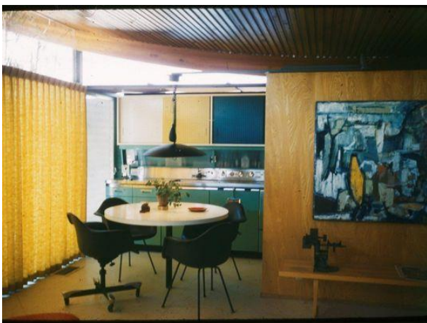
This vintage photo shows how the kitchen in the Miles Bates house in Palm Desert originally looked. The metal cabinets have since been replaced with wooden cabinets. The photo is from the Walter S. White papers, Architecture and Design Collection, at the Art, Design & Architecture Museum at UC Santa Barbara. (Photo: Courtesy of Art, Design & Architecture Museum at UC Santa Barbara)

But long before it was purchased by the city, the 800-square-foot, one-bedroom, one-bath house at 73697 Santa Rosa Way, underwent some renovations that obstruct the view of the roof from the street, so many don't realize they are passing by a desert jewel.