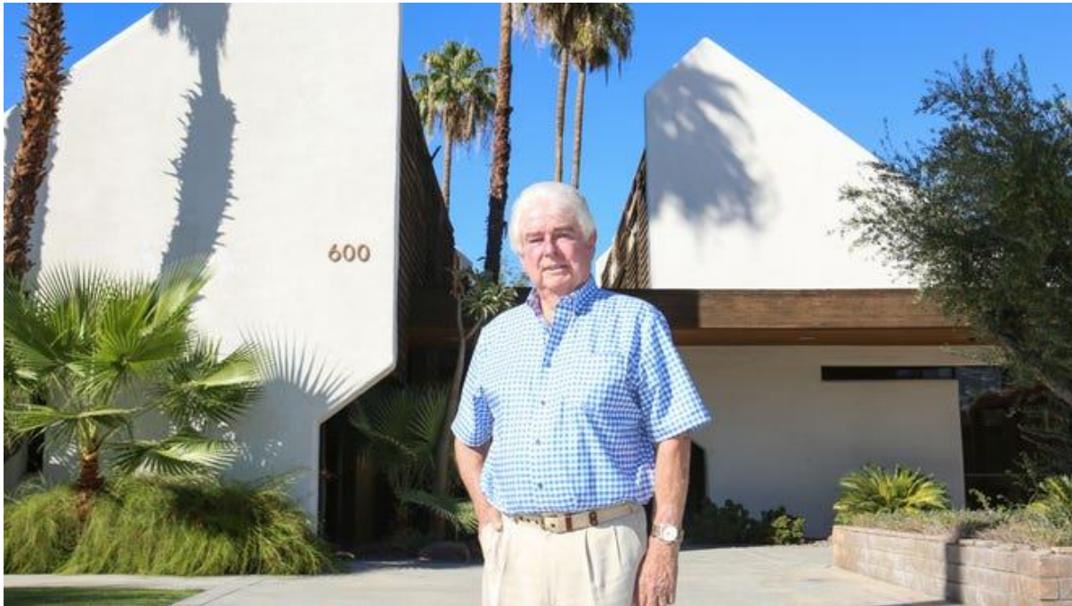
Architect Hugh Kaptur pictured at the building he designed at 600 Tahquitz Canyon Way in Palm Springs, October 16, 2016.

Today, I'm asked to autograph a wall of a house I designed 50 years ago; participate on panel discussions; consult on restoration projects; give interviews for newspapers and magazines; and even attend glamorous parties honoring me. That's what a museum exhibition, a film and a new book will do for one's anonymity.