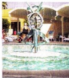
The mineral pool sits outside the Spa Resort Casino hotel in Palm Springs on March 26, 2010.