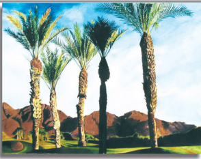
Kender - PGA West