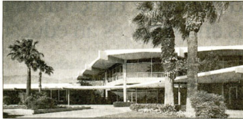
GLEN WEXLER GARYWEXLERDESIGN