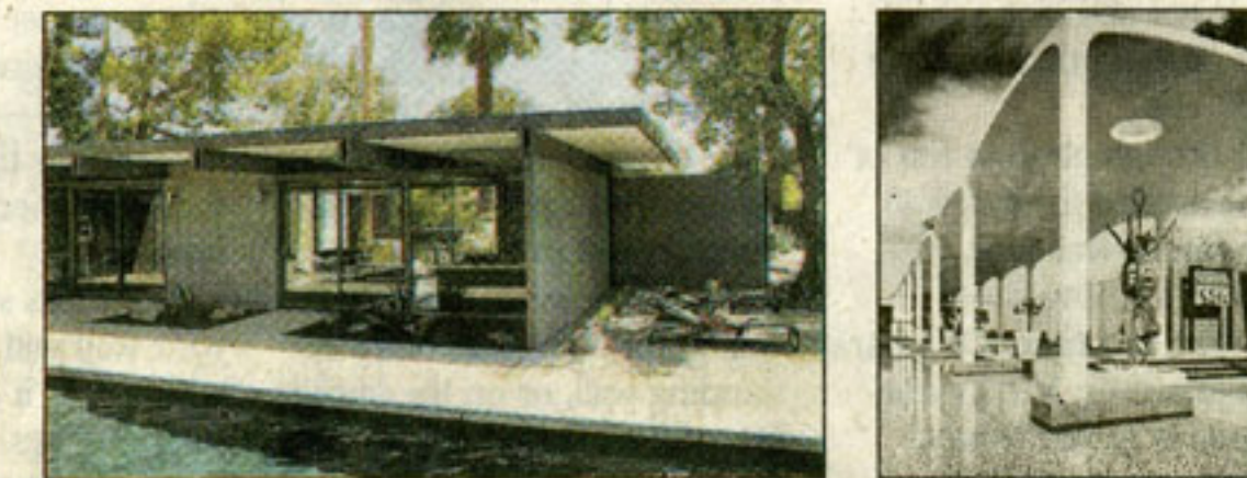
COLIN FAULKNE GARYWEXLERDESIGN